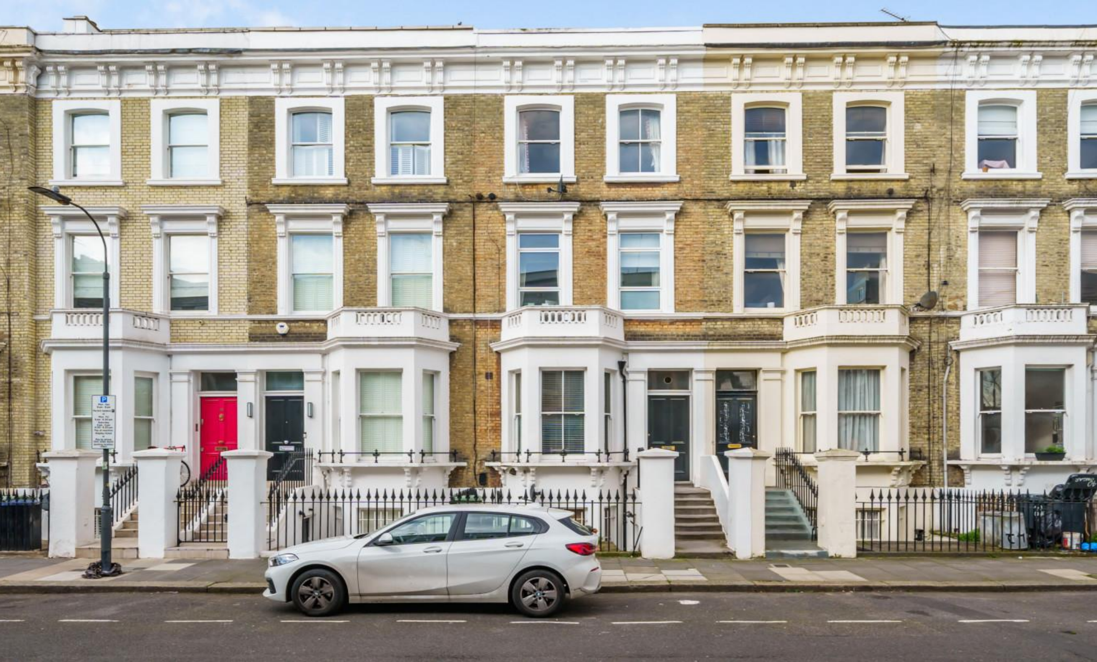
Ongar Road, London SW6