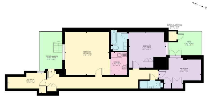
Lower Ground Floor 1035 ft 2