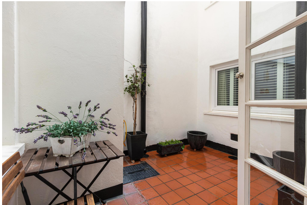
Queen's Gate Terrace, SW7 Approximate Gross Internal Area = 96.13 sq m / 1,035 sq ft

This plan is for layout guidance only. Not drawn to scale unless stated. Windows and door openings are approximate. Whilst every care is taken in the preparation of this plan, please check all dimensions, shapes and compass bearings before making any decisions reliant upon them. (ID767266)