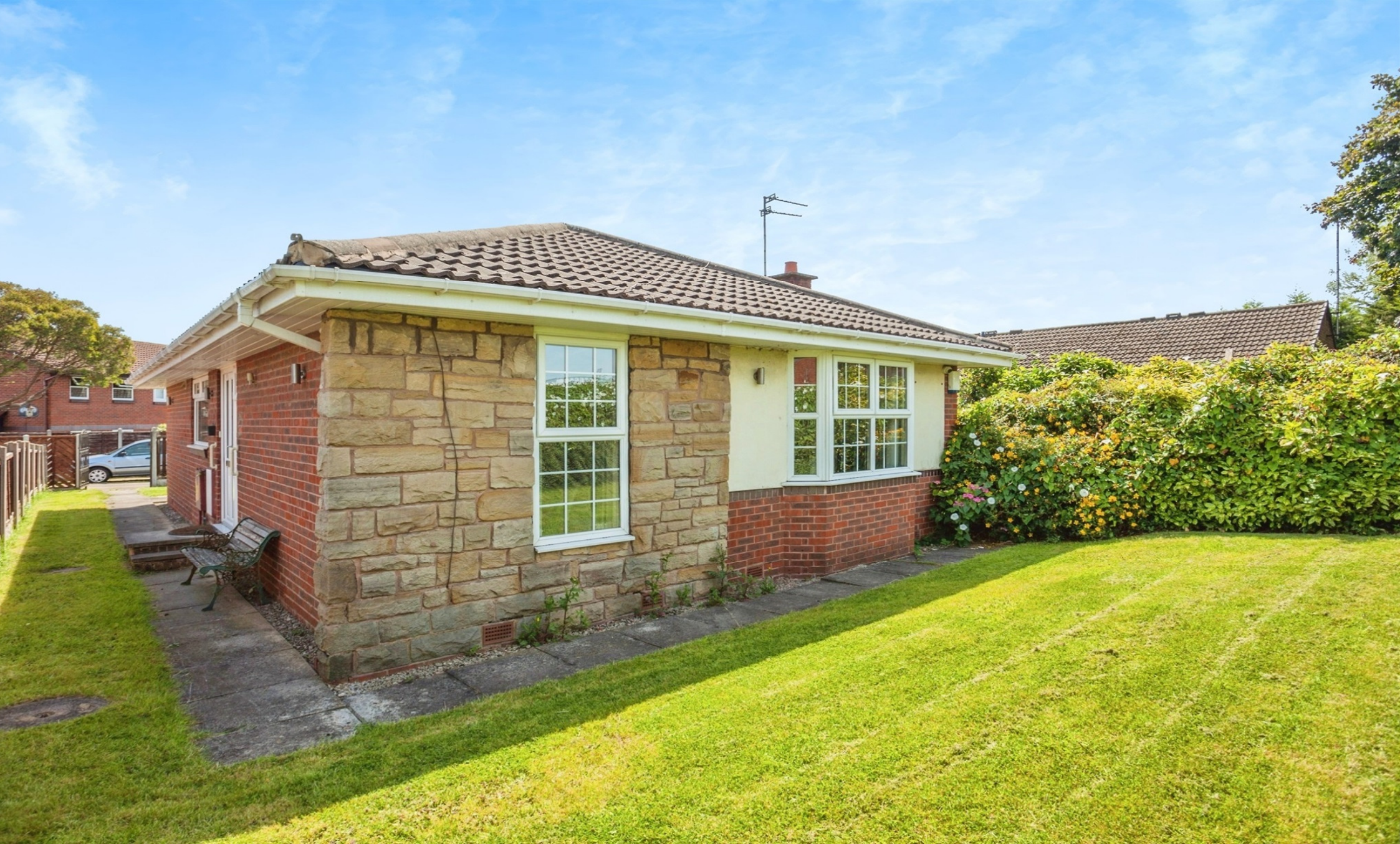
Meadow Garth, Wakefield WF1 3TE