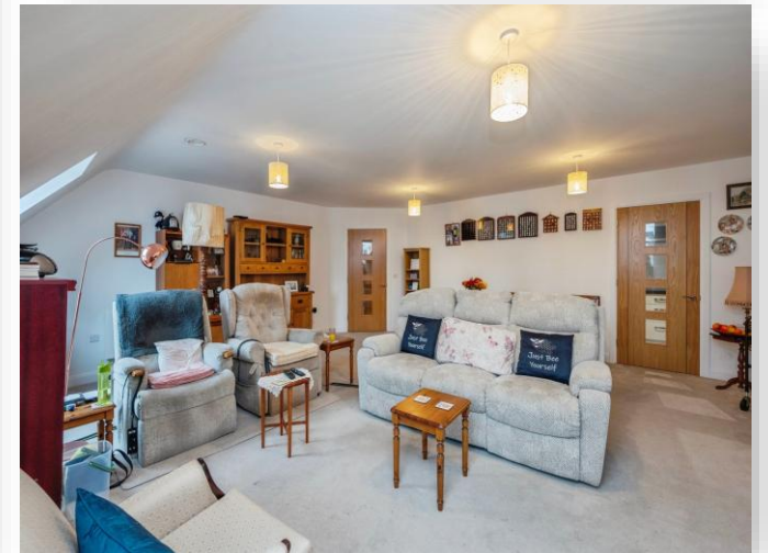
Louis Arthur Court New Road, North Walsham NR28 9FJ