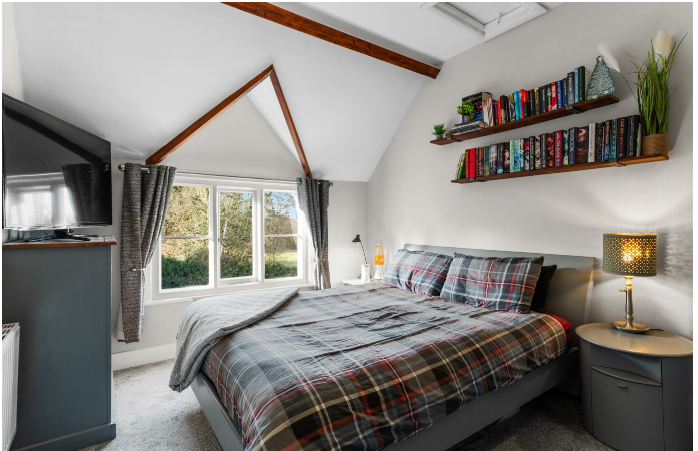
Troop Cottage, 27 Vicarage Lane, Sherbourne, Warwick, CV35 8AP