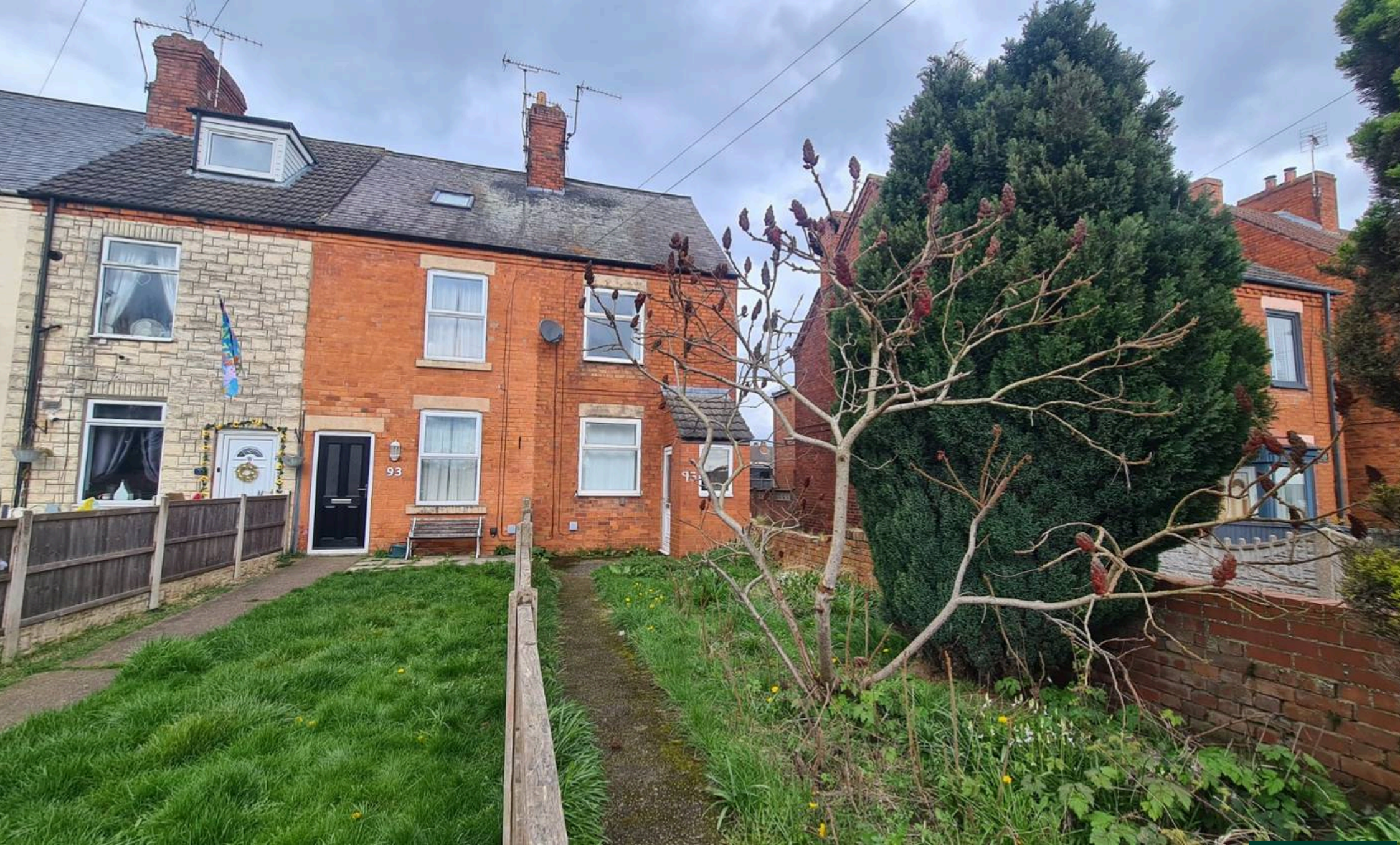
95 Queens Road, Hodthorpe £120,000