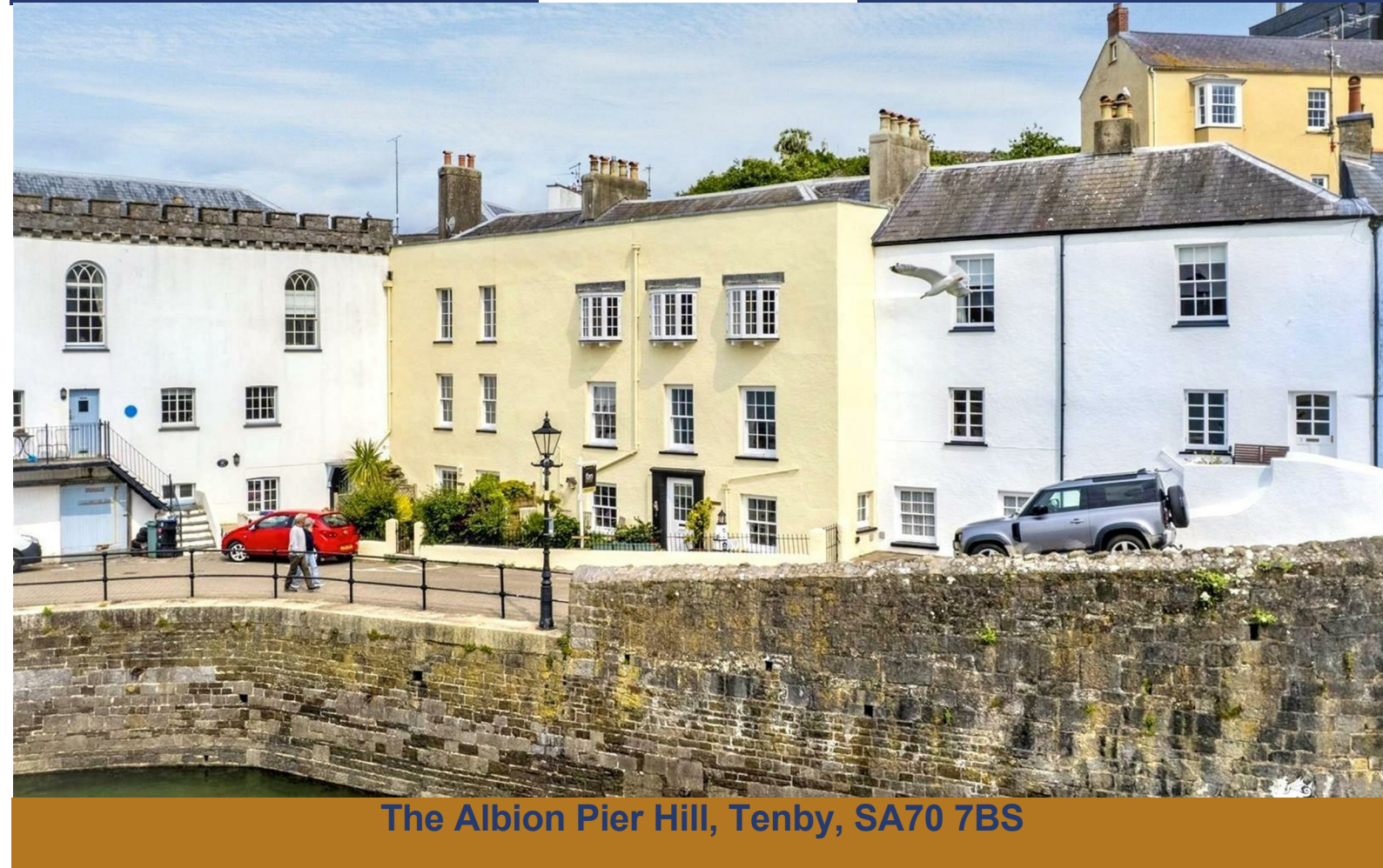
The Albion Pier Hill, Tenby, SA70 7BS