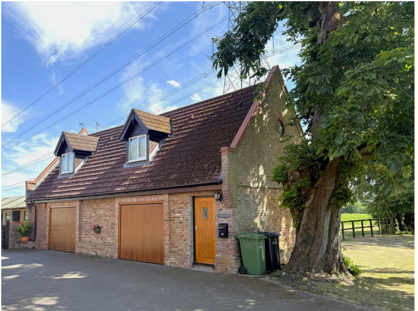
Coach House Flat | Lynn Road | Tilney All Saints