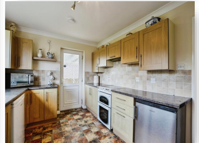
Storeys Lane, Burgh Le Marsh Skegness PE24 5LP