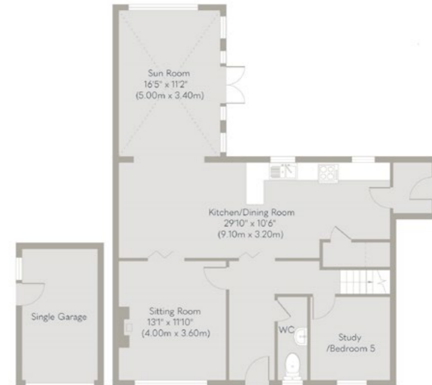
Garage Ground Floor Approximate Floor Area 927 sq. ft (86.15 sq. m)

Whilst every attempt has been made to ensure the accuracy of the floor plan contained here, measurements of doors, windows, rooms and any other items are approximate and no responsibility is taken for any error, omission, or mis-statement. This plan is for illustrative purposes only and should be used as such by any prospective purchaser or tenant. The services, systems and appliances shown have not been tested and no guarantee as to their operability or efficiency can be given.