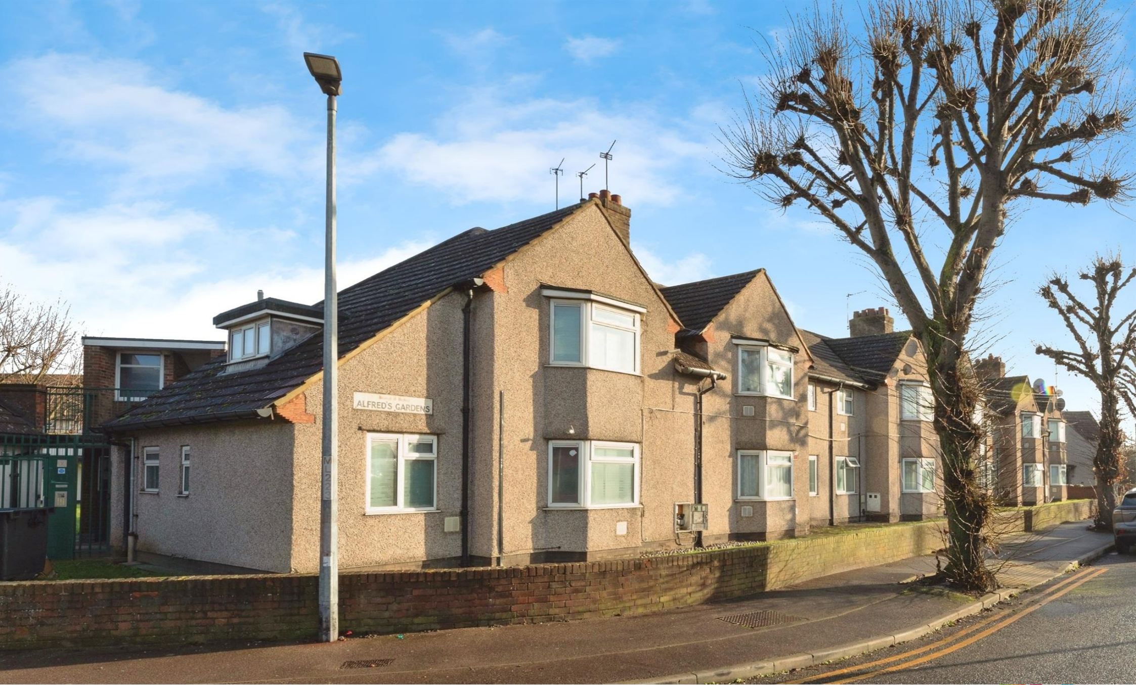
Alfreds Gardens, Barking, IG11 7XN