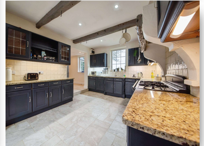
Willow Farm Digby Fen, Billingham Lincoln LN4 4DT