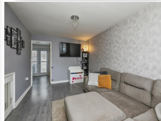
Pickhills Grove, Goldthorpe Rotherham S63 9FN