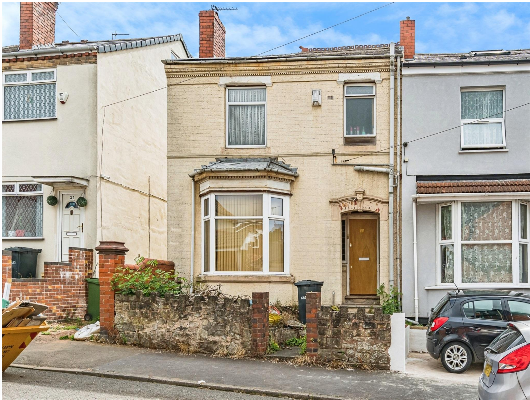
Junction Street, Dudley DY2 8XT