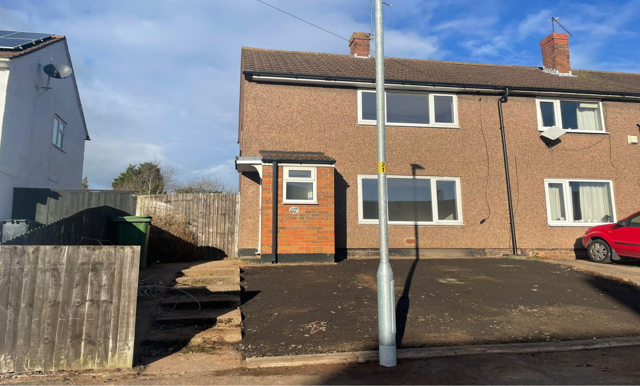
Broom Crescent, Kidderminster DY10 3BN