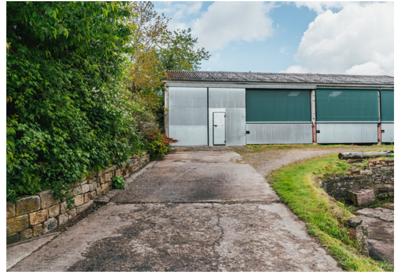
DETACHED HAY BARN