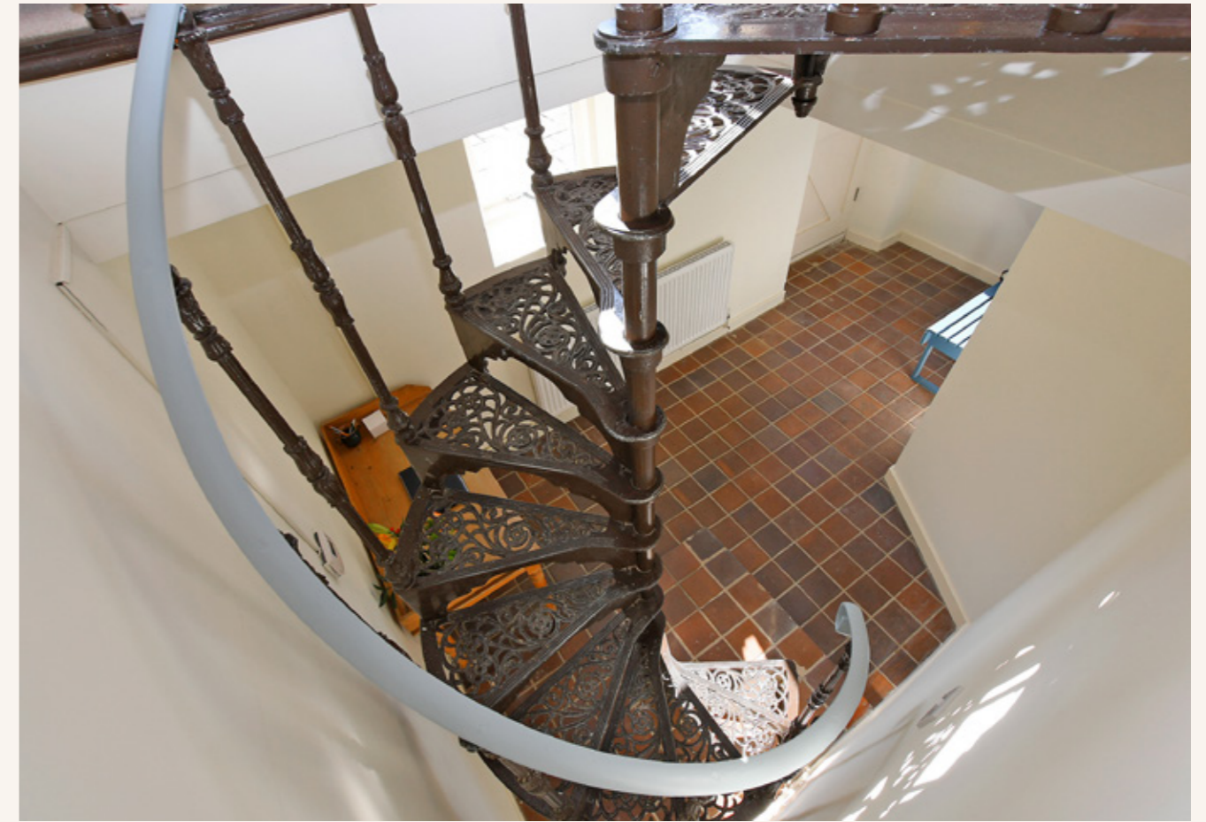
ENTRANCE HALL & SPIRAL STAIRCASE

Having recessed lighting, extractor fan, chrome heated towel rail and tiled flooring with electric under floor heating. A suite in white comprises a low-level WC and a wash hand basin with a chrome mixer tap and storage beneath. To one wall is a shower enclosure with a fitted rain head shower, an additional hand shower facility and a glazed screen/door.