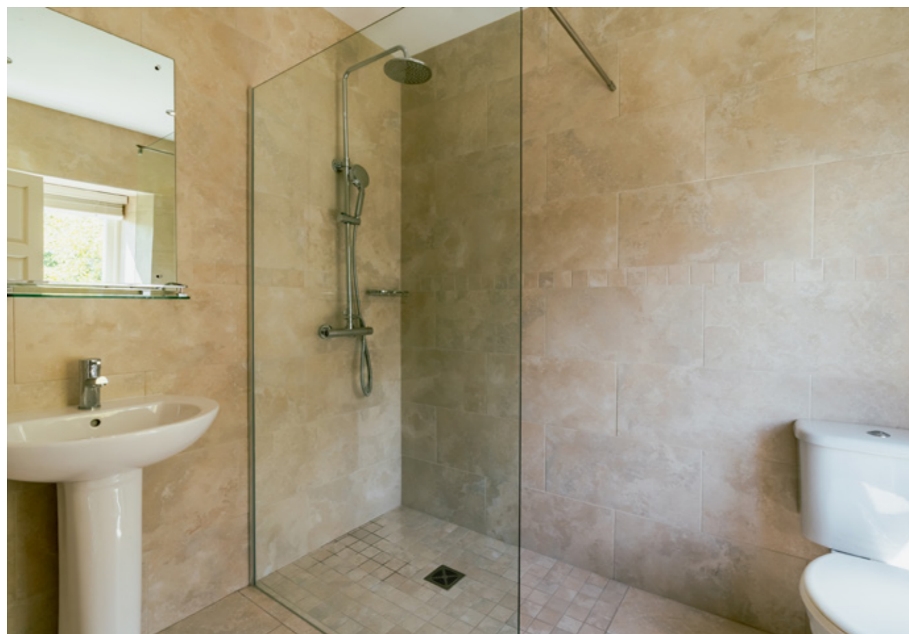
BEDROOM 2 EN-SUITE SHOWER ROOM