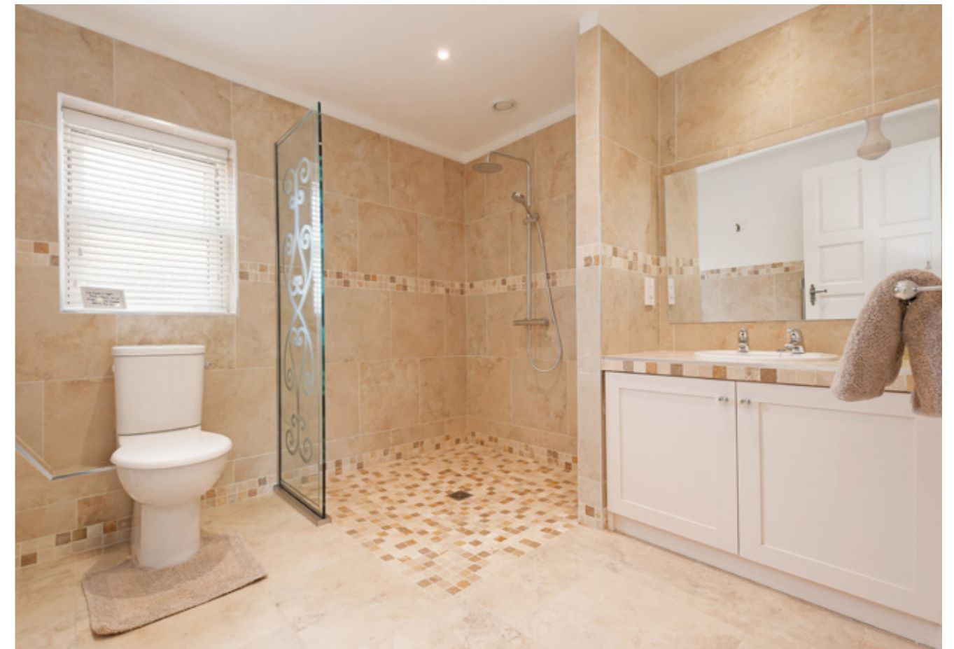
FAMILY SHOWER ROOM