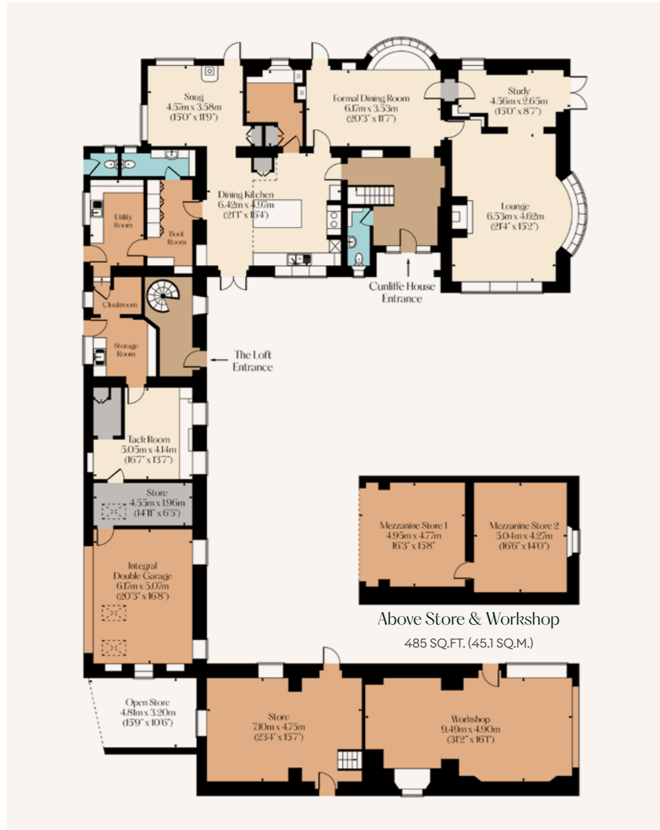
Above Store & Workshop 485 SQ.FT. (45.1 SQ.M.)

Garaging Approximate Floor Area: 1158 SQ.FT. (107.6 SQ.M)