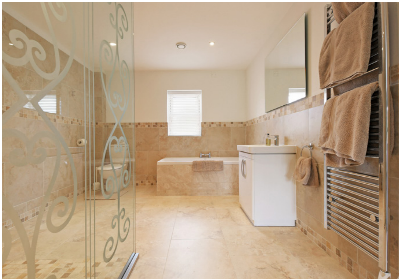
BEDROOM 1 EN-SUITE BATHROOM