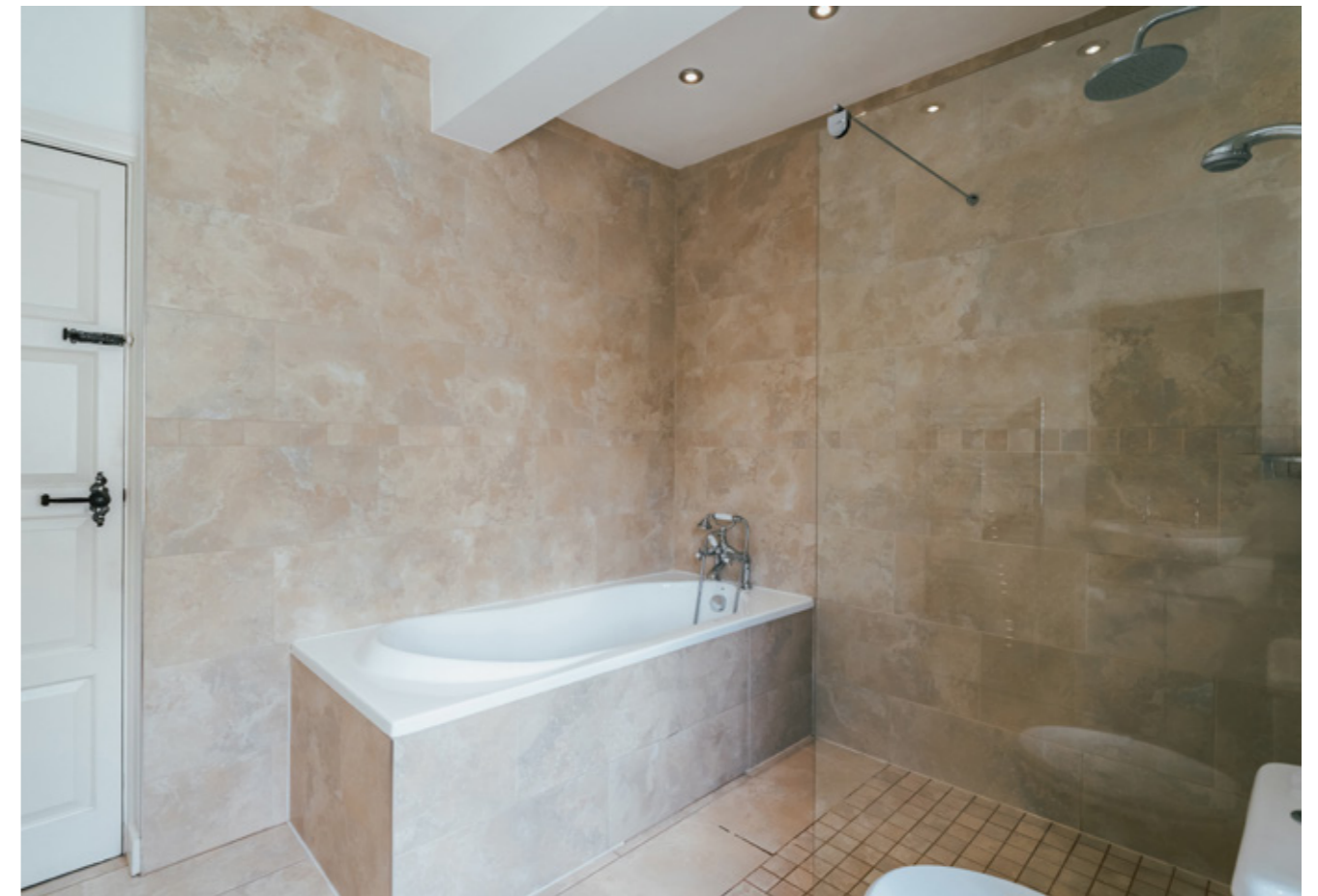
MASTER EN-SUITE BATHROOM