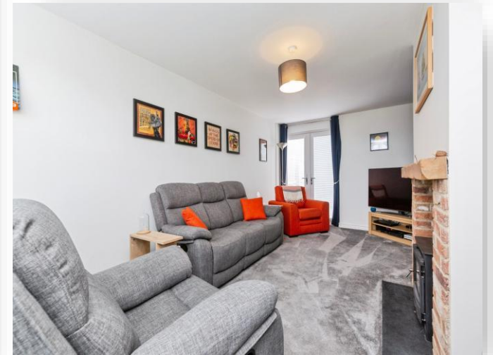
Dodsworth Walk, Hartlepool TS27 3PF