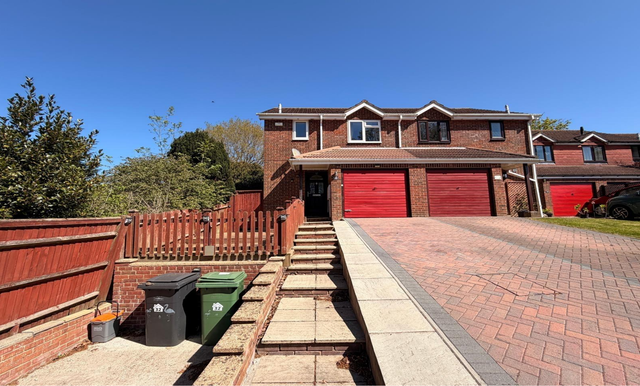
Lynwood Close, St. Leonards-On-Sea TN37 7HT