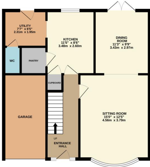
GROUND FLOOR 685 sq.ft. (63.6 sq.m.) approx.