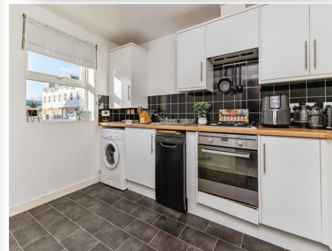
Conyers Way, North Ormesby Middlesbrough TS3 6LP