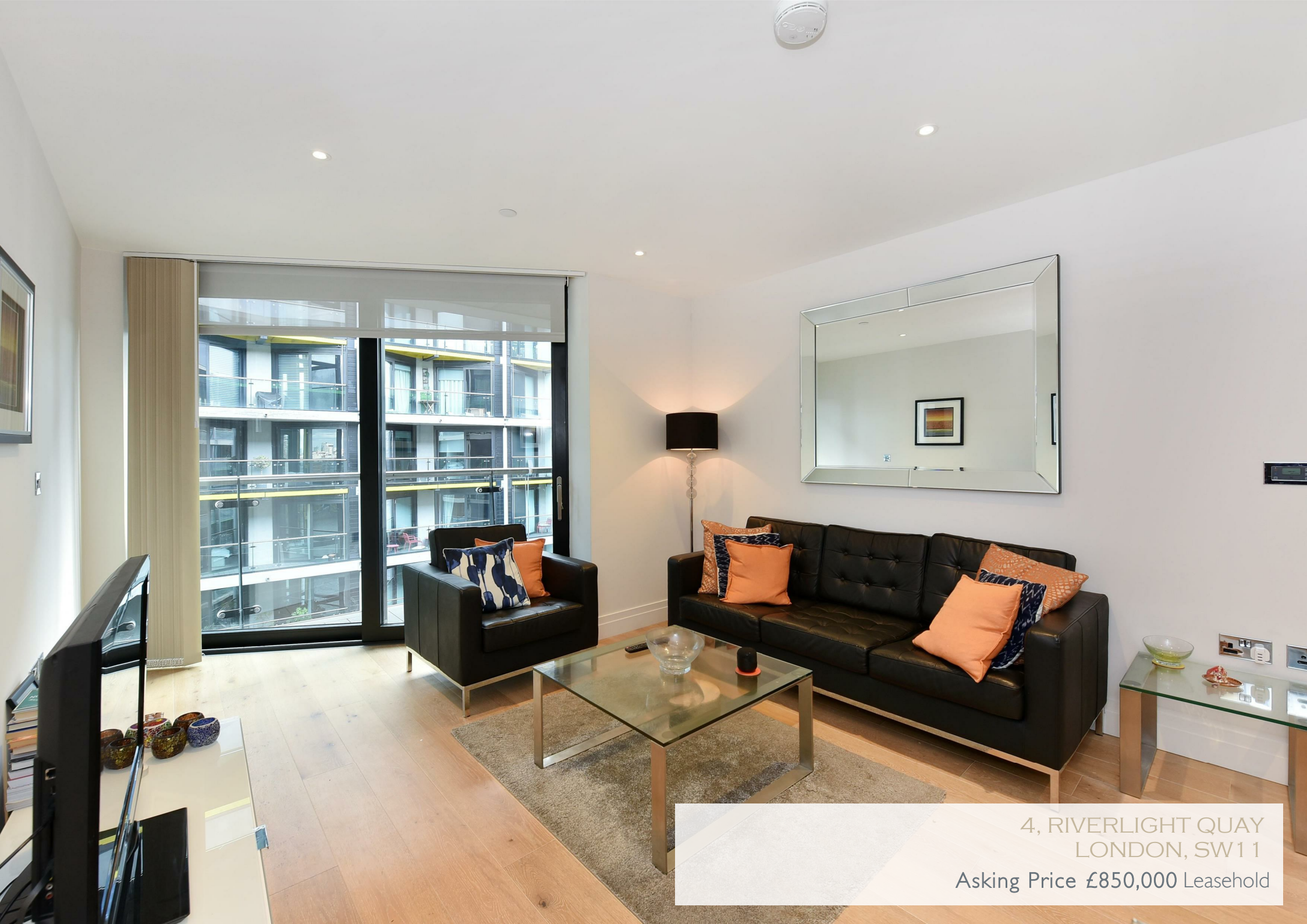
4, RIVERLIGHT QUAY LONDON, SW11 Asking Price £850,000 Leasehold