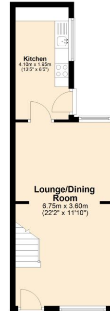
Ground Floor Approx. 32.5 sq. metres (349.7 sq. feet)