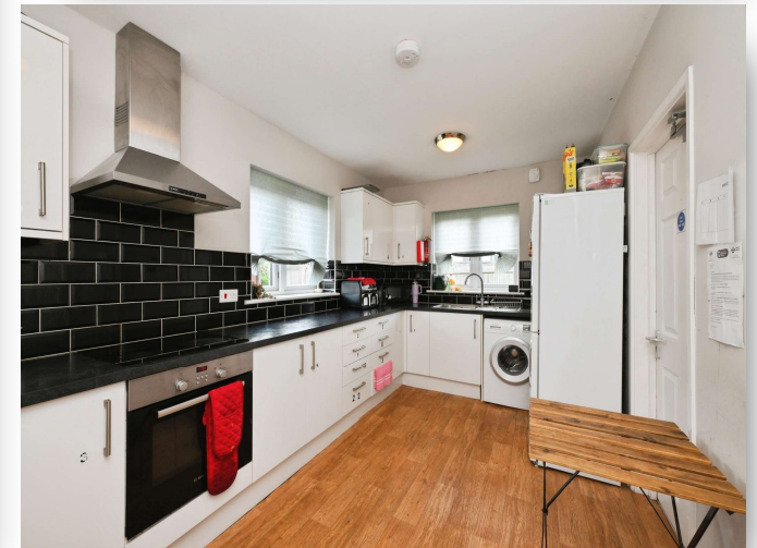
Tower Road, Ware SG12 7LP