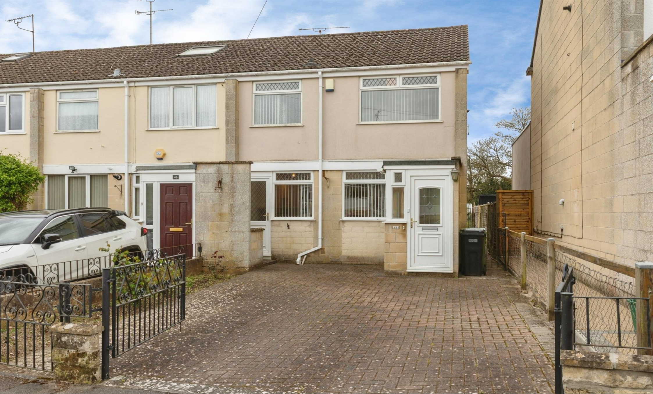
Greenbank Gardens, Bath BA1 4EE