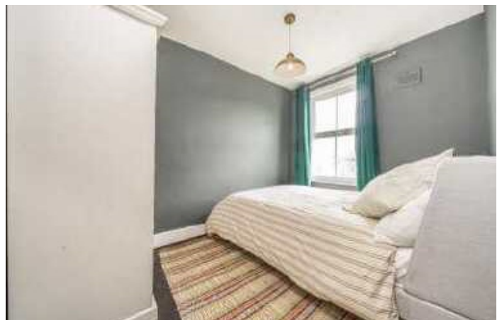
Balchier Road, SE22