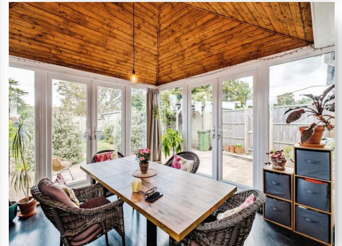
Halewick Lane, Sompting Lancing BN15 0NE