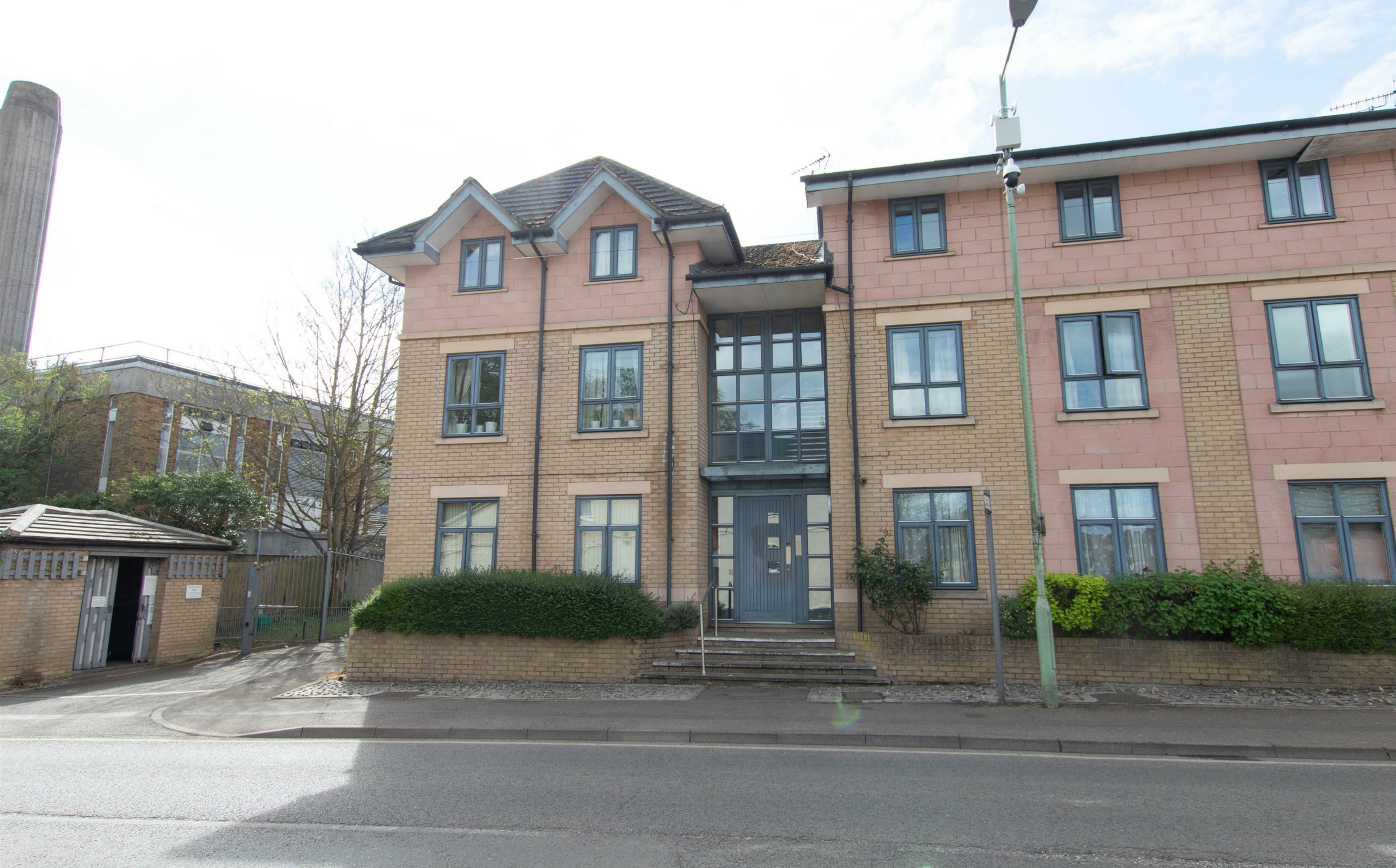
Cavendish House, Haverhill, CB9 8JY