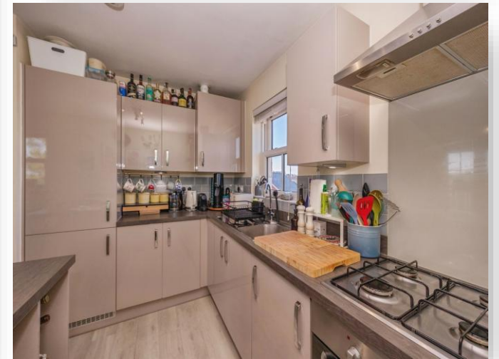
Plant Farm Crescent, Waterlooville PO7 3DB