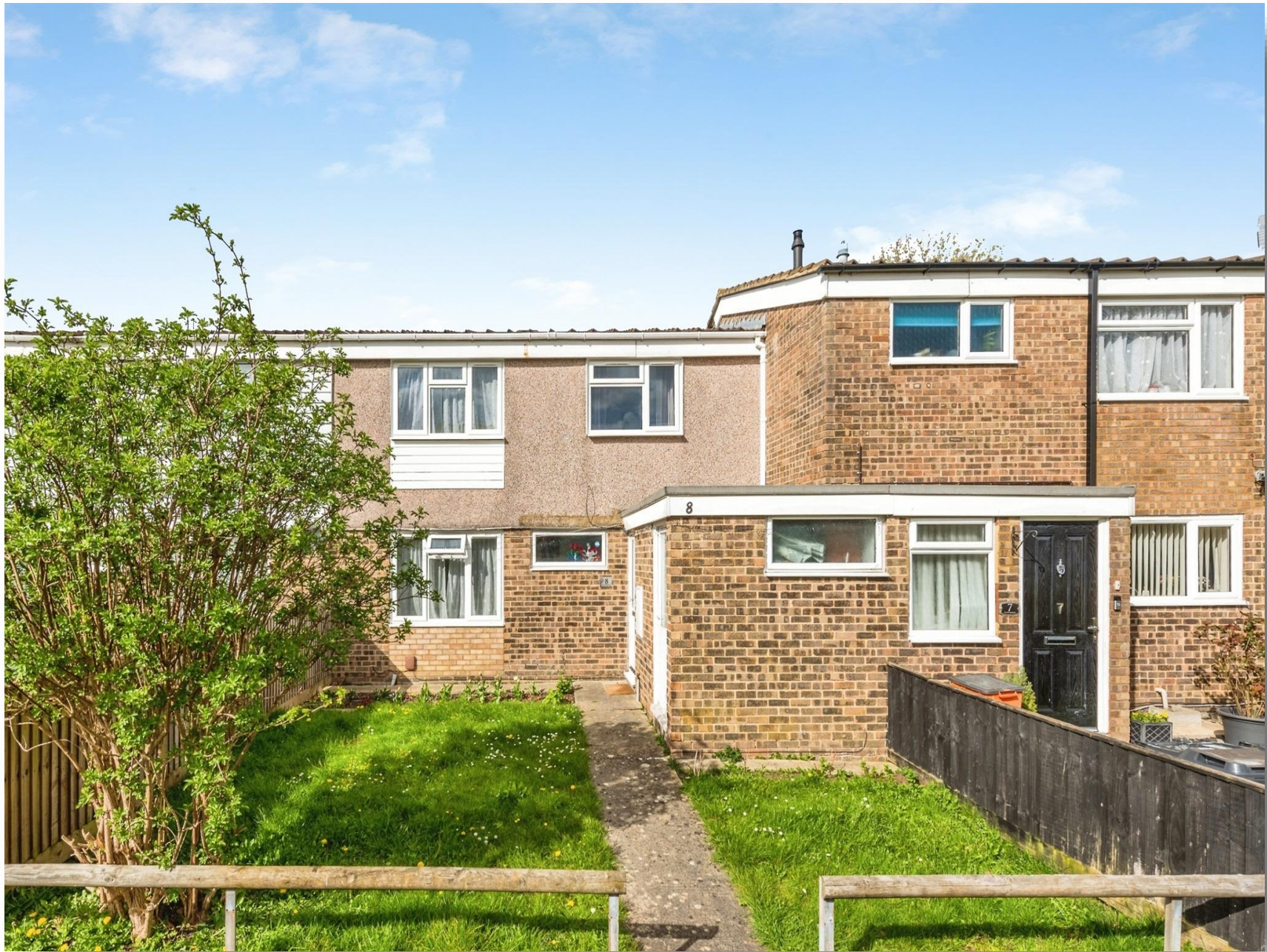
Islandsmead, SWINDON SN3 3TG