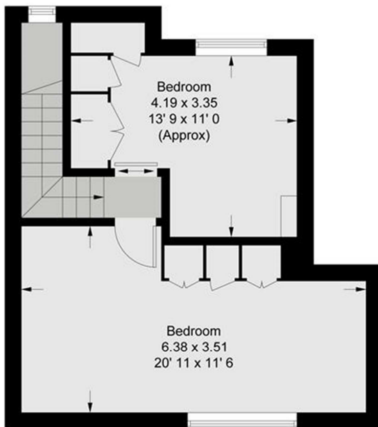
First Floor 411 sq ft / 38.2 sq m