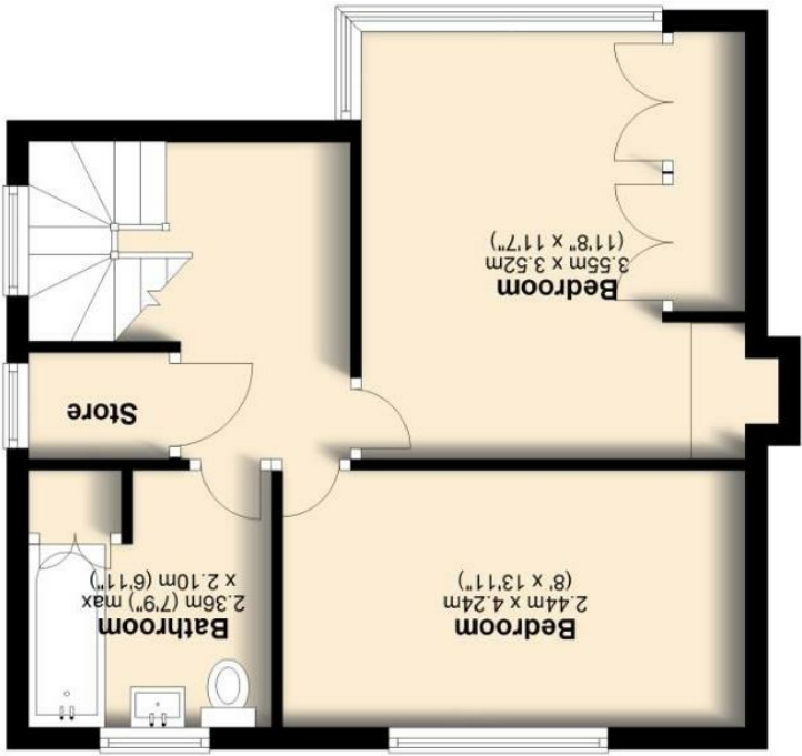
First Floor Approx. 38.3 sq. metres (412.5 sq. feet)

Total area: approx. 86.4 sq. metres (930.4 sq. feet)