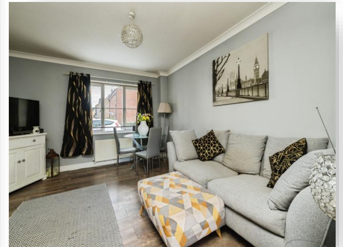
Violet Way, Yaxley Peterborough PE7 3WE