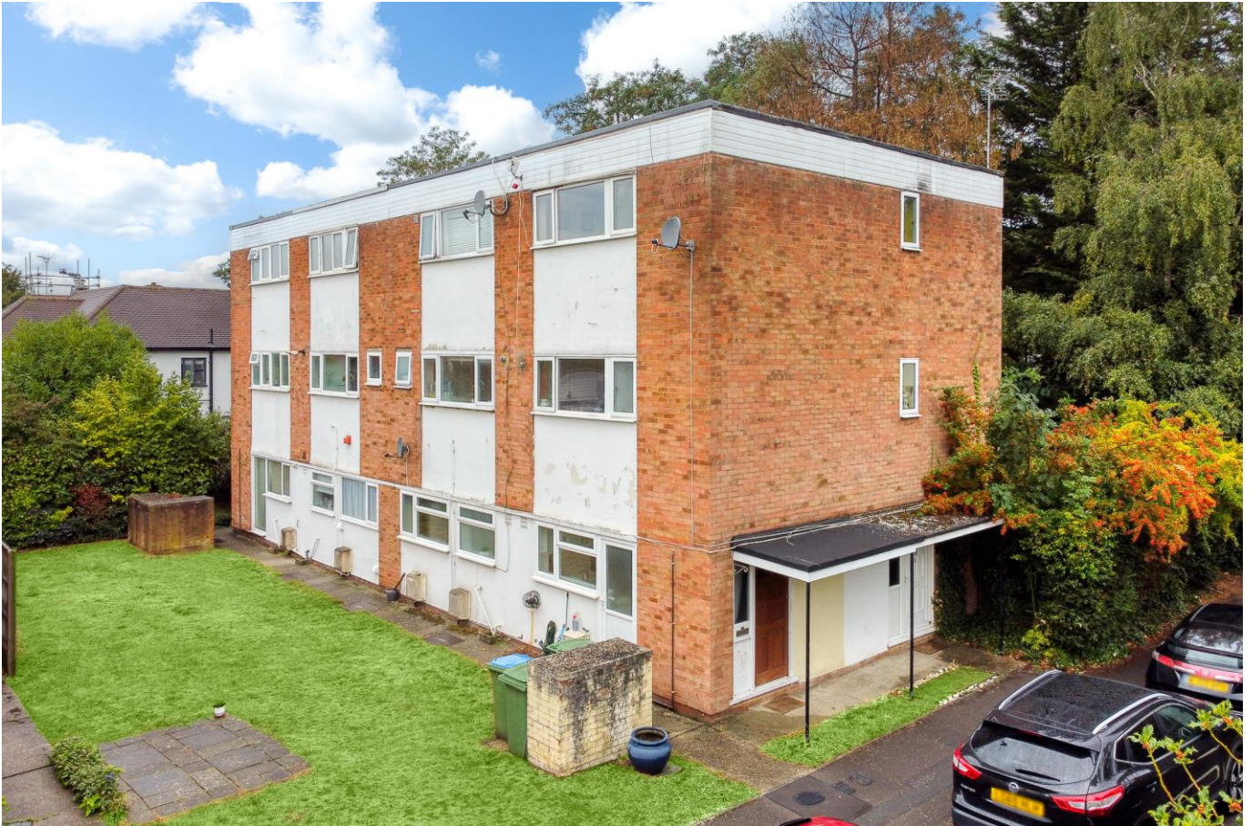
5 Devoke Way Walton-On-Thames Surrey KT12 3ES