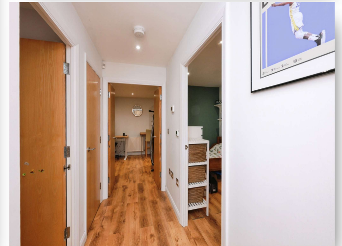
Yorkes Mews, Ware SG12 9DB