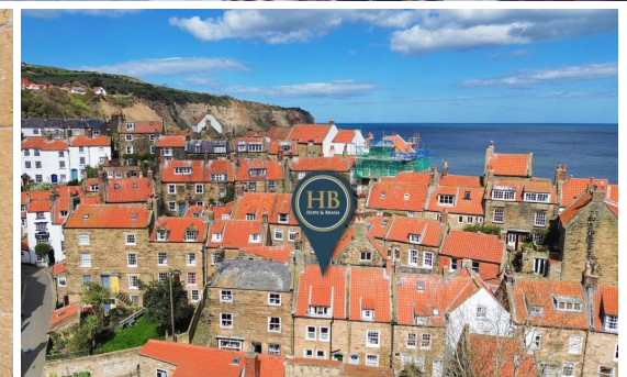
BIRKBY COTTAGE, ROBIN HOODS BAY- 3 bed Cottage -£325,000