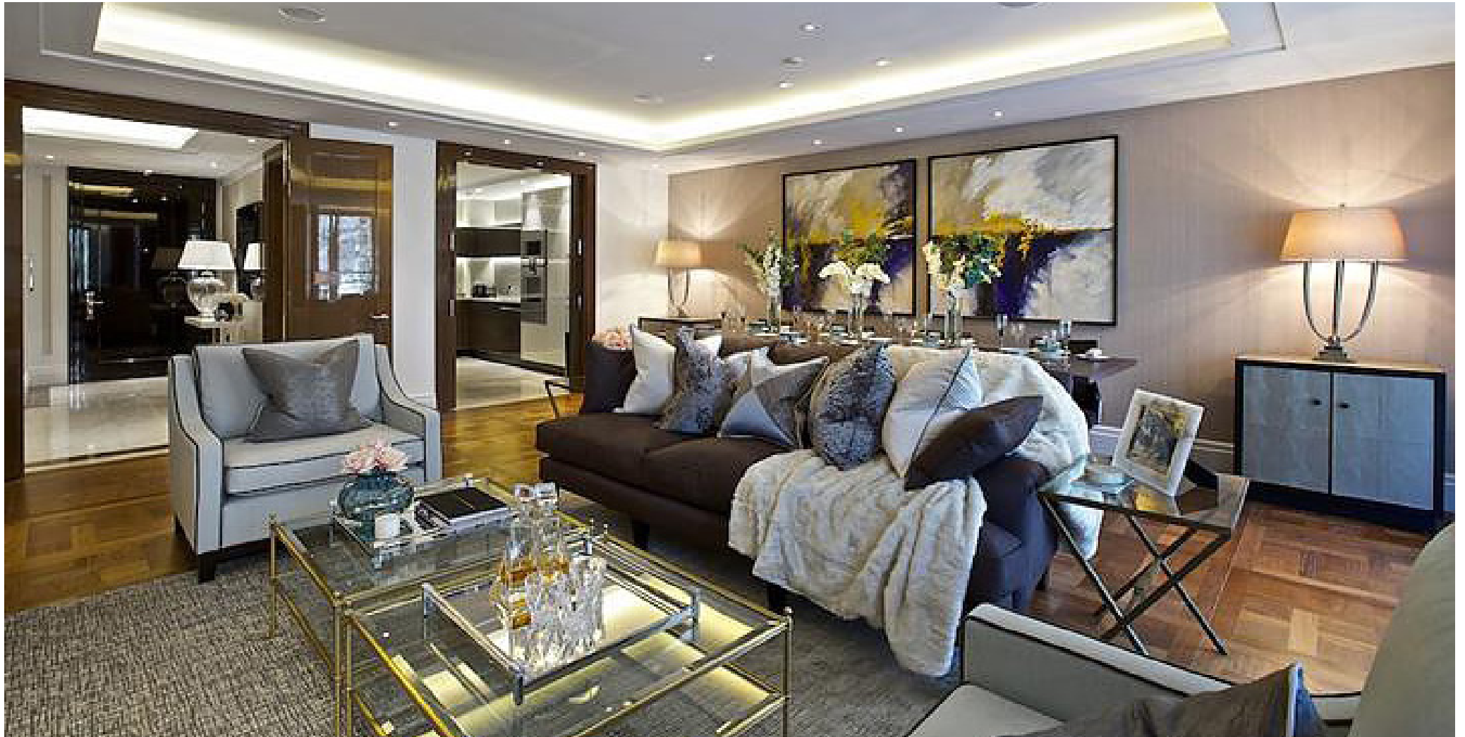
EBURY SQUARE, London SW1W