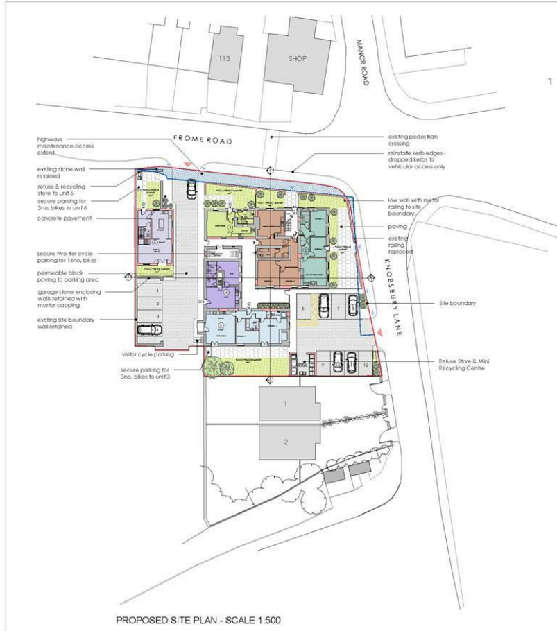
PROPOSED SITE PLAN - SCALE 1:500