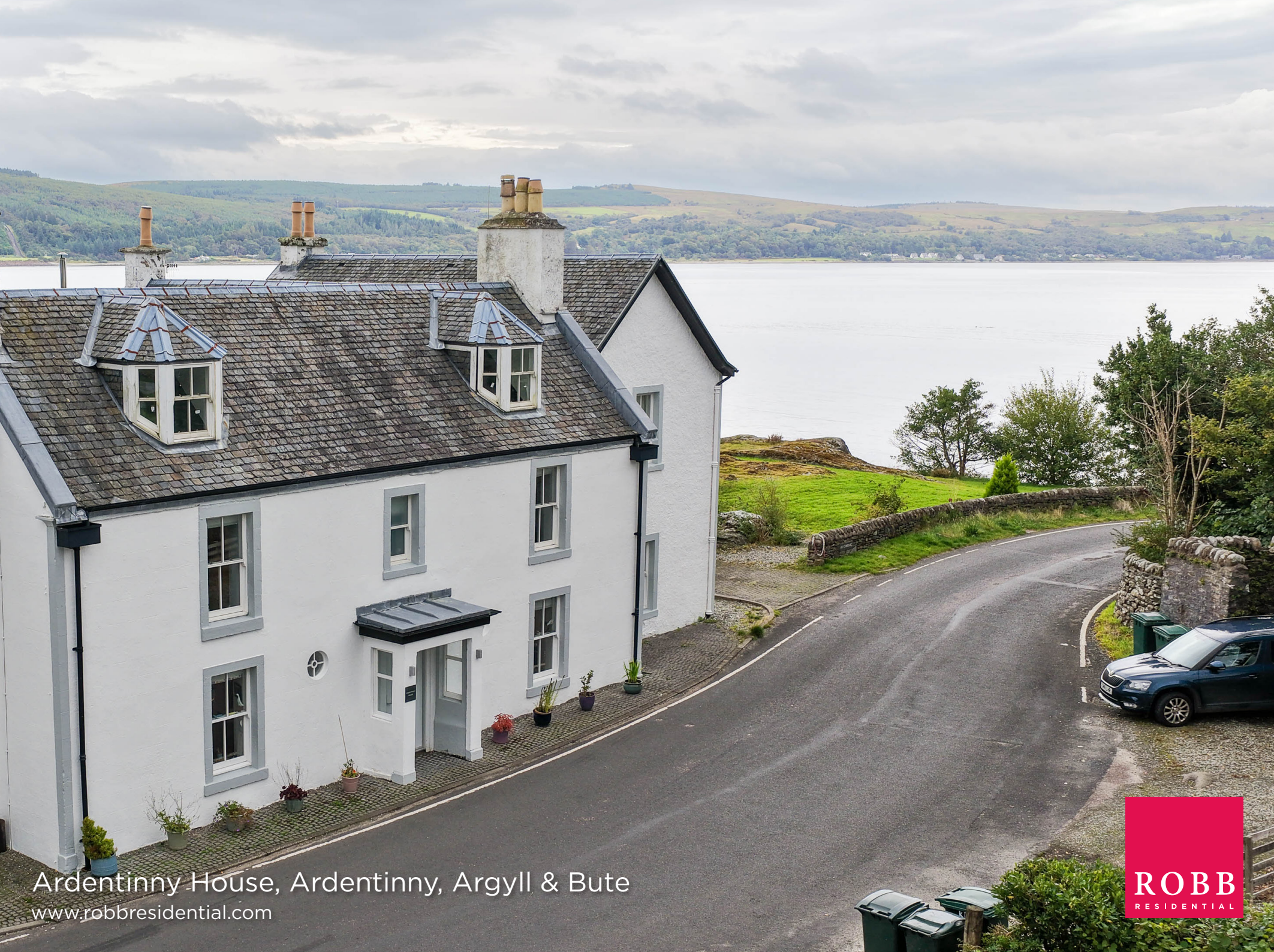
Ardentinn House, Ardentinn, Argyll & Bute www.robbrresidential.com