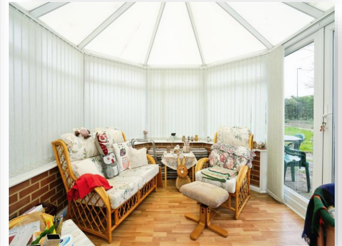
Tower Road, Sompting Lancing BN15 9JL