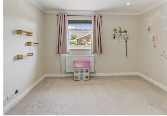
Bedroom two 11'5 x 10'4 (3.48m x 3.15m)