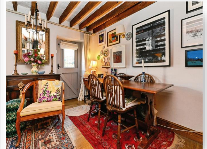
Mill Row, Blackborough End, KING'S LYNN, PE32 1SJ