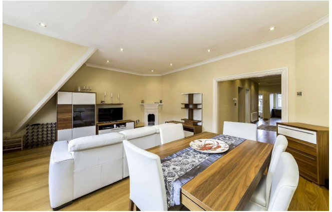
Park Street, W1K