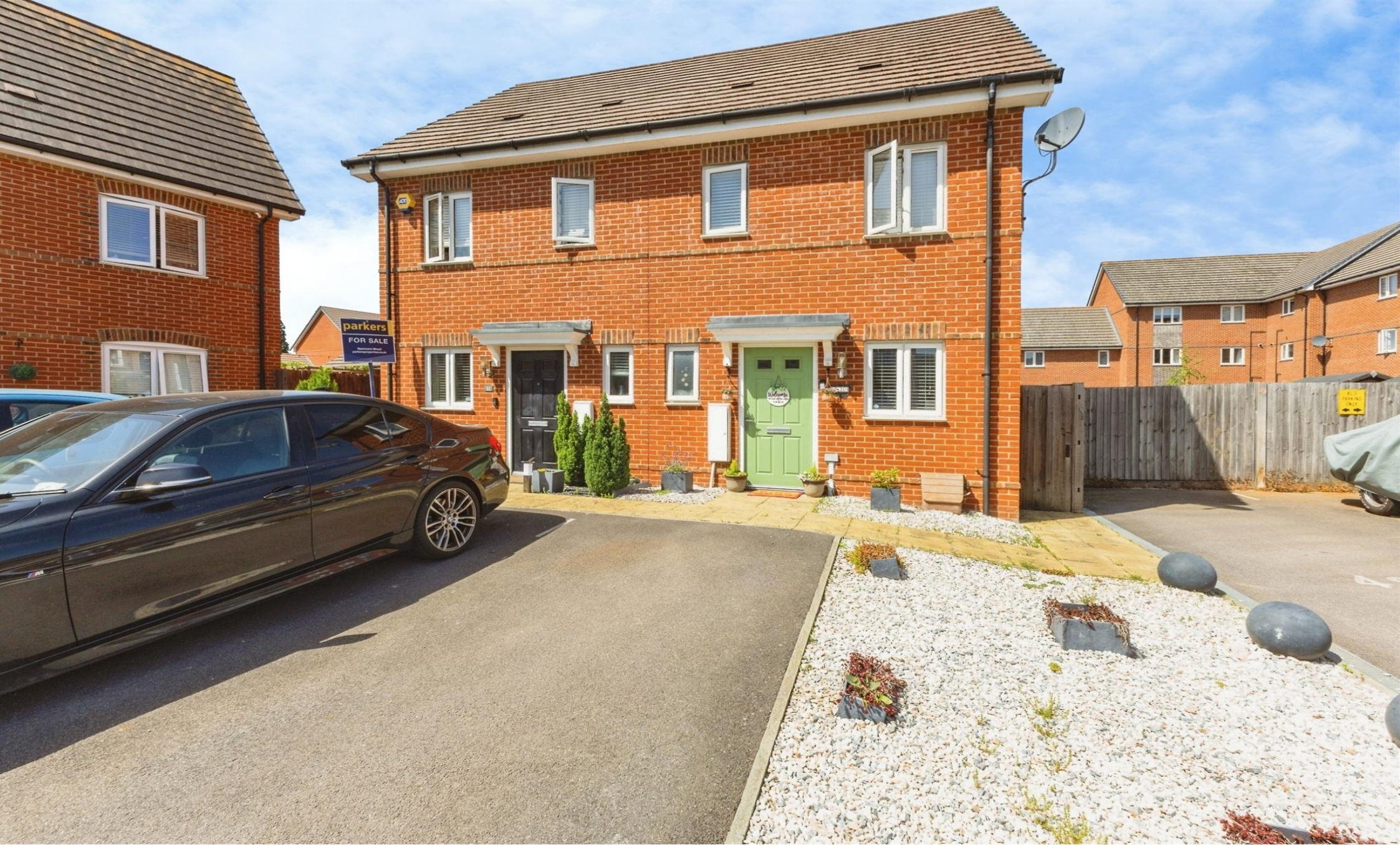
Appleby Walk, Spencers Wood Reading RG7 1UZ