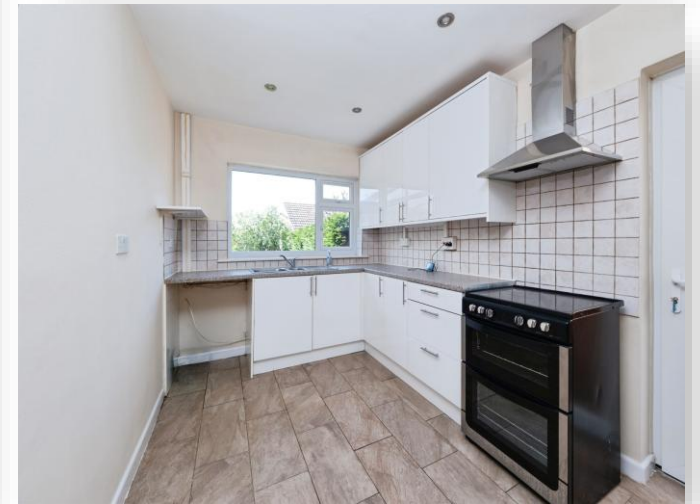
Mays Way, Potterspurty Towcester NN12 7PR