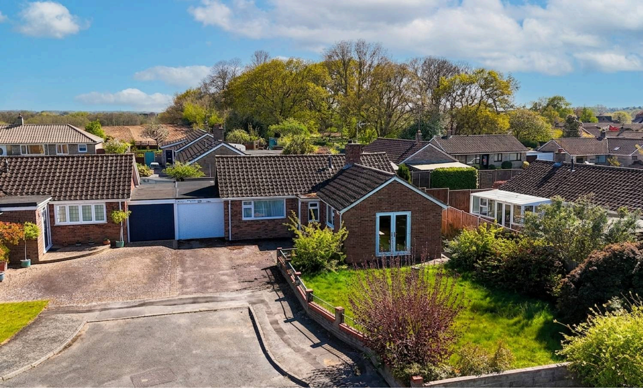
Hillcrest, Chedgrave - NR14 6HX