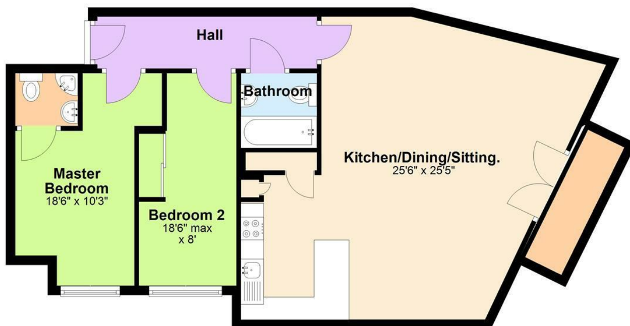
Ground Floor Approx. 803.4 sq. feet