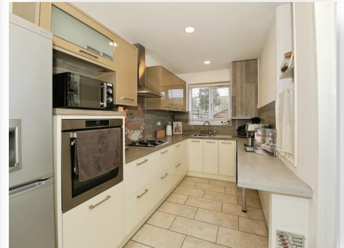
Welland Road, Dogsthorpe Peterborough PE1 3SJ