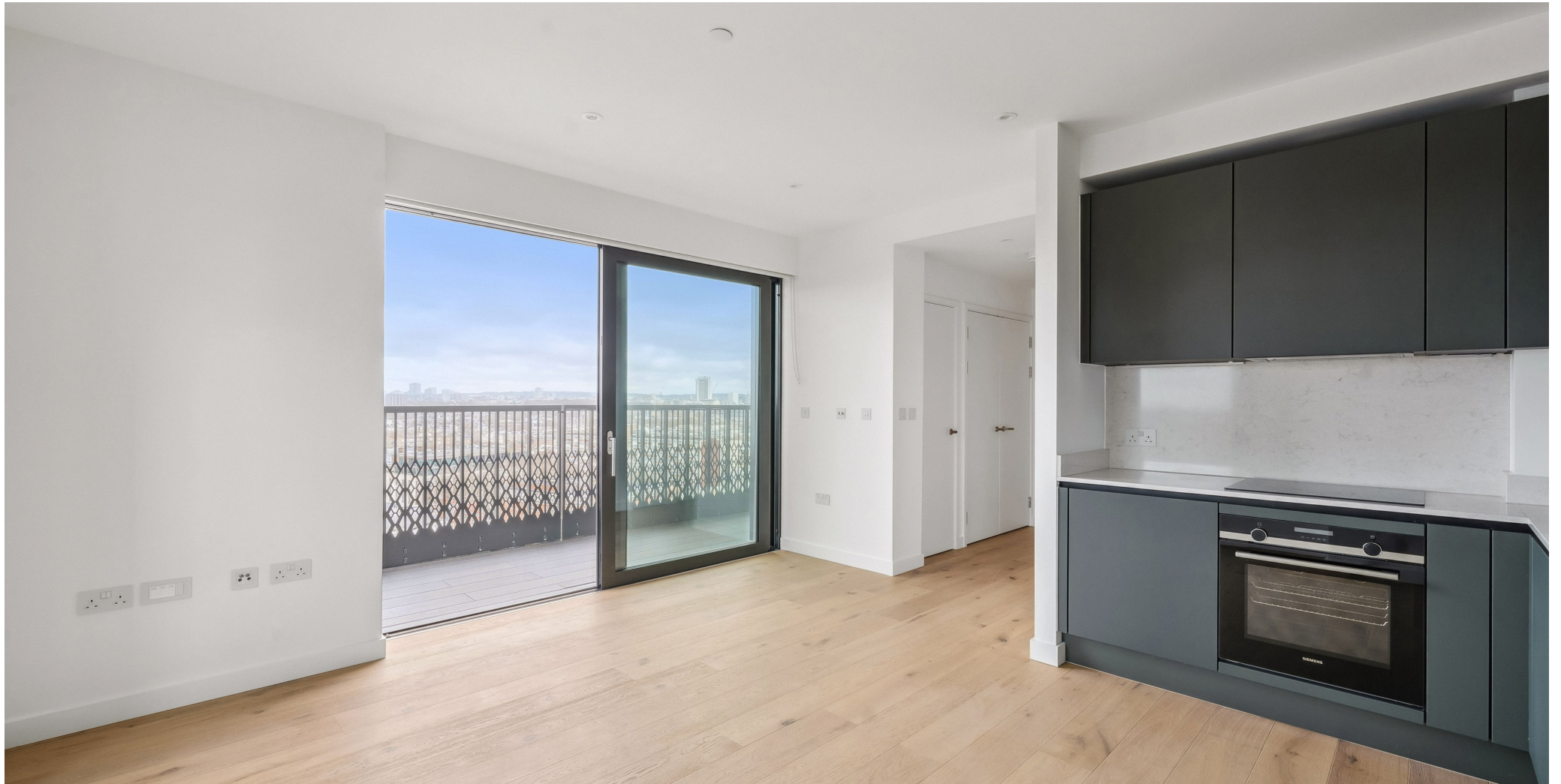
ALBA SQUARE, Belgravia SW1W