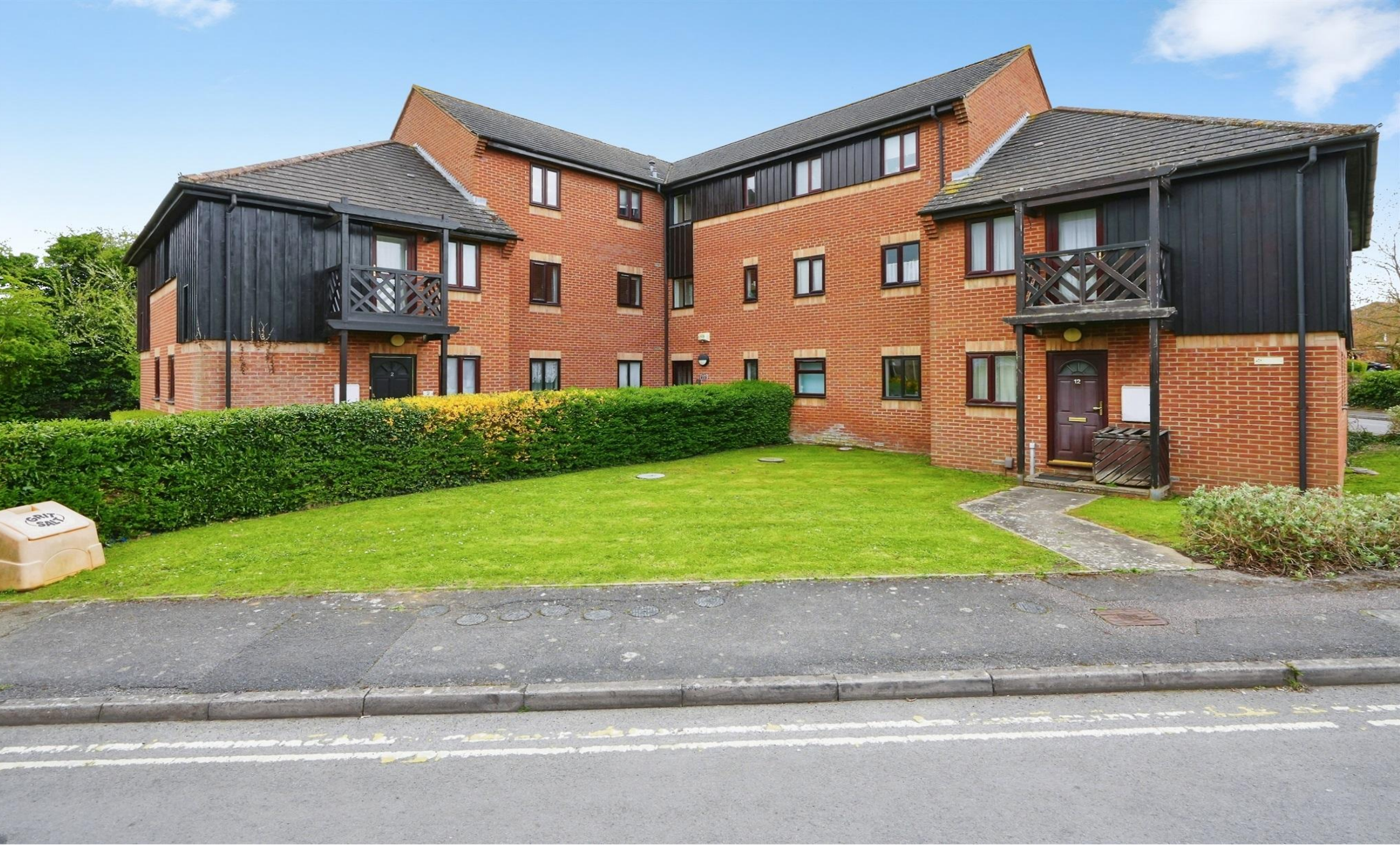
Roebuck Court, Didcot, OX11 8UT