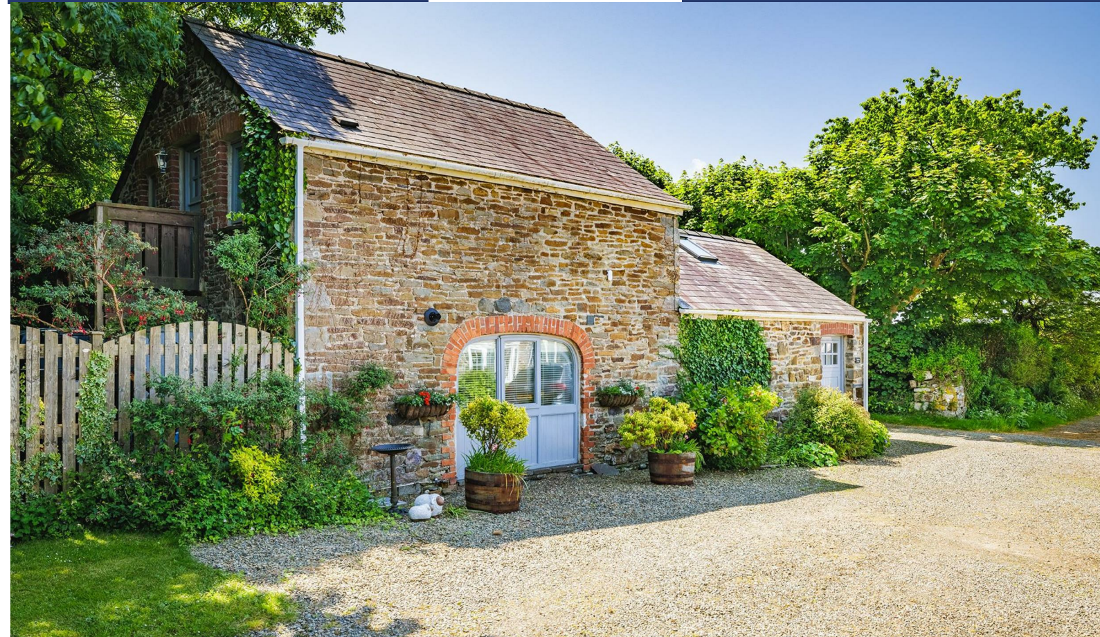
Meadow Barn And Cottages Roch, Haverfordwest, Pembrokeshire, SA62 6AF

This floorplan is only for illustrative purposes and is not to scale. Measurements of rooms, doors, windows, and any items are approximate and no responsibility is taken for any error, omission or mis-statement. Icons of items such as bathroom suites are representations only and may not look like the real items. Made with Made Snappy 360.